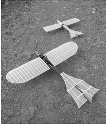
Hanriot and Blackburn