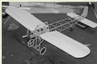
Above: New Bleriot Plan in development for 2009 Meet - 16" span

Bill Hannan designed Sommer monoplane construction. The fuselage structure uses primarily 1/16" sq. balsa, and the wings and tail are