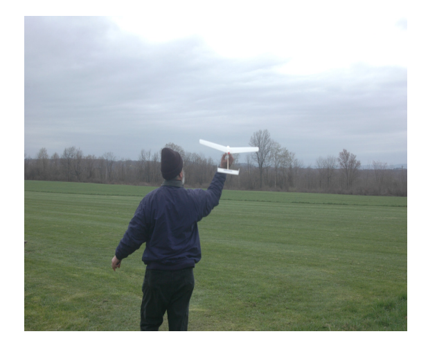
The only plane to fly at the work party! Jim's little free flight.