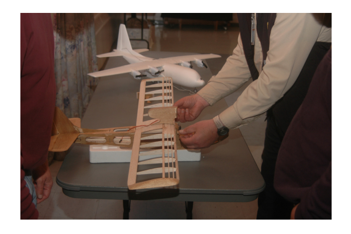
Time to go outside— The Wallkill Field Work Party! And Baby it was cold outside!