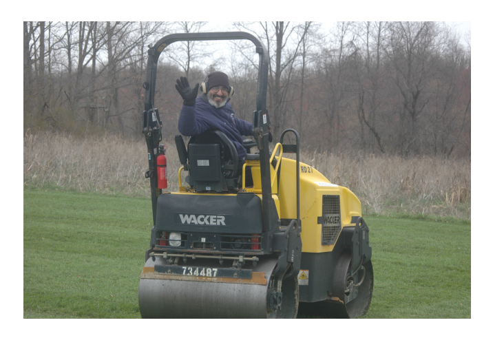
Let the good times roll, roll on and on!