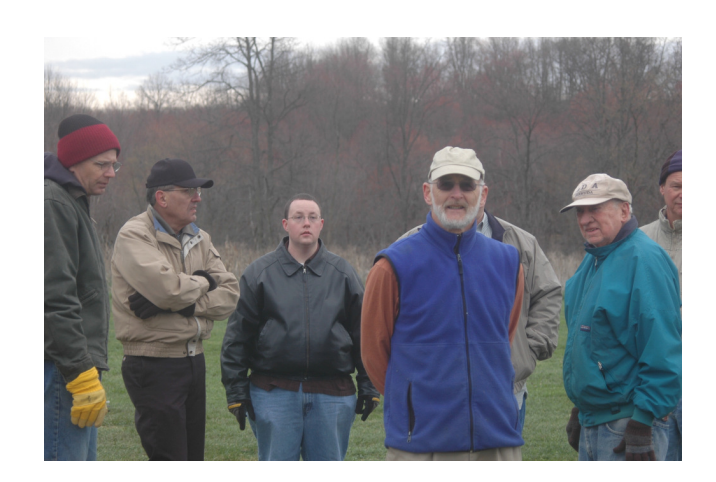
Club members? Or a typical town work crew! Sorry guys!