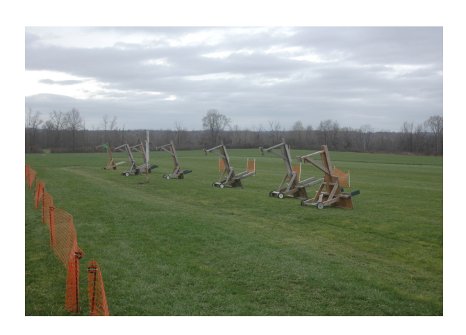
The 2011 flying season at the Wallkill field is underway!