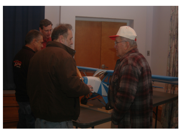
And the Cub has been back in the air since these photos.