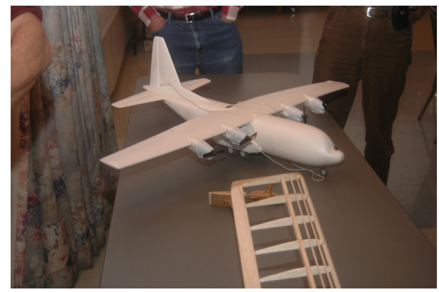
A few photos of Rick's most recent projects.