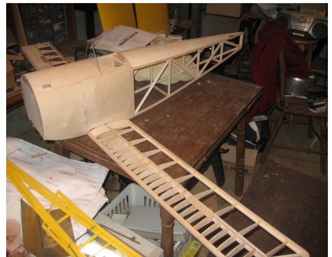
The bottom wing ready to get wing mount dowels.

That is it for now. Wishing you all a very happy and healthy new year! CAVU - Ron Revelle