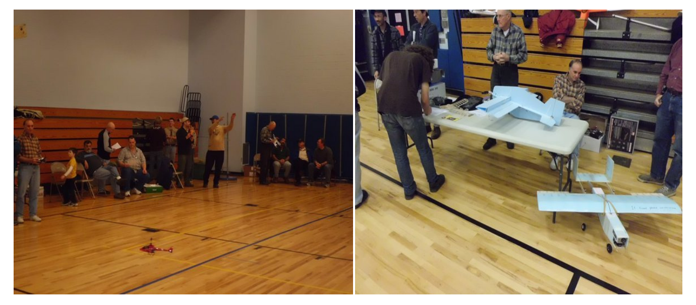
Pictures of the Model Masters Dec. Indoor Flying session at the Highland Middle School. Lots of familiar faces.

The MHRCS work parties helping at the Rhinebeck Aerodrome continue.