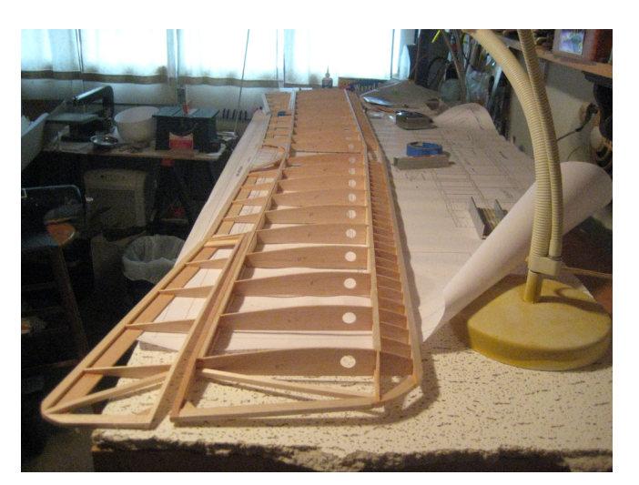
The upper wing framed up..