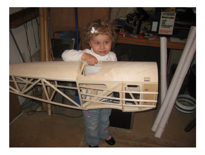
Some of you guys had better start sending me photos of your winter projects or you are going to be seeing a lot more pictures of my grandchildren!