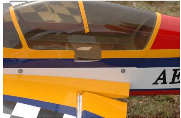
After the landing! The general consensus was that the miniature pilot in Roger's Yak decided to bail out when Roger scared him half to death on the landing approach!