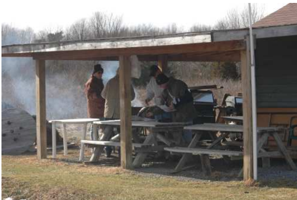
A nice wood fire provided an opportunity to warm up a bit or shoot the breeze!