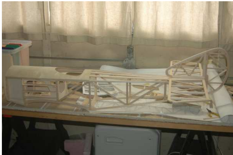
Meanwhile in Western Europe (Orange County) this Sopwith Pup is being "thrown together" to be flown by Capt. Eddie RickenRevelle