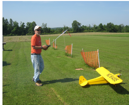
A Friday morning at the field.