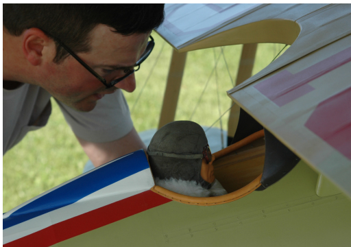
Another Friday morning...The pilot gets his flight plan and his safety belt is checked by the builder!