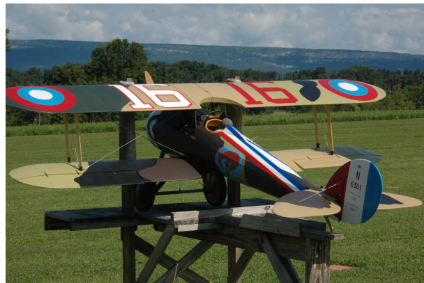
Ready to take to the air after three years in the making.