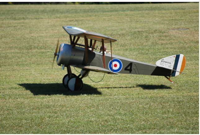
This pup was part of the show as well.