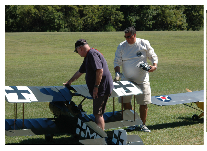
Appreciation to the other pilots that participated in the RC demonstration. This German captured Pup spent a lot of time in the air during the weekend.