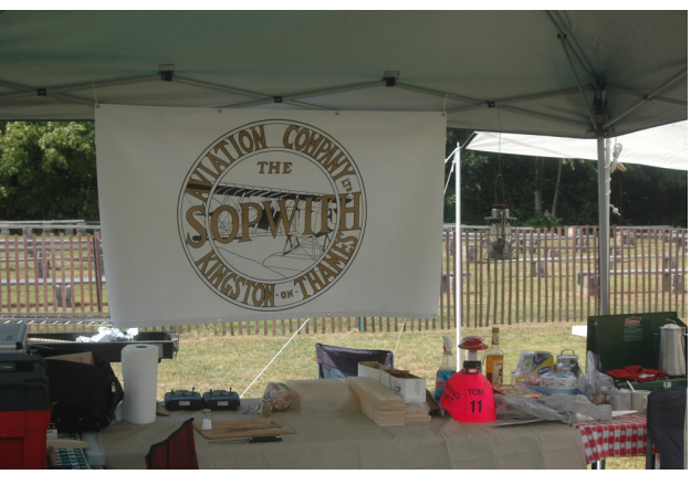
Behind the fence were some interesting items......I have never seen a Coleman lantern run on that kind of fuel.