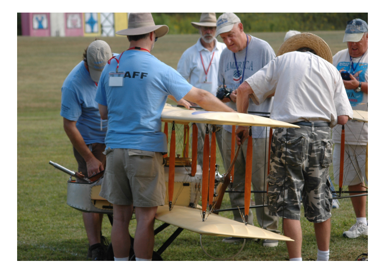
Like most "far superior" engines, this one was quite demanding to start. In fact, it never ran well enough to fly the aircraft. Getting at the prop to start it is not something I would enjoy doing.