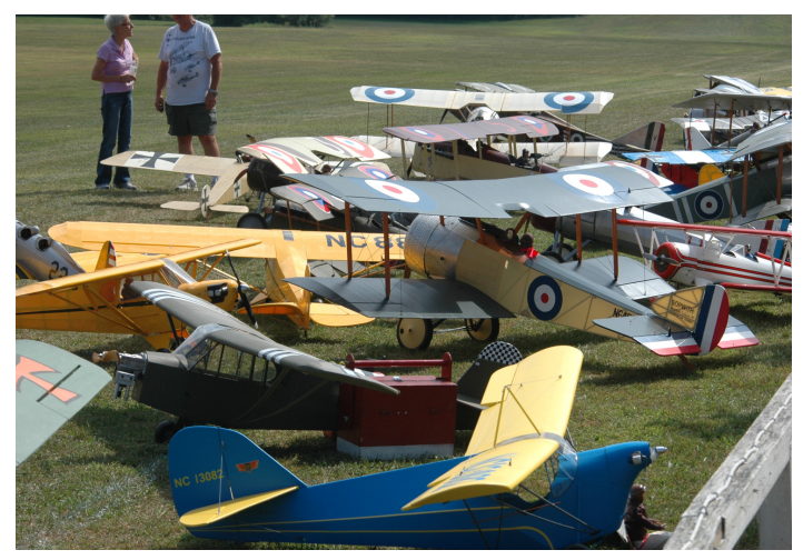
Another sample of the collection of planes making an appearance at Rhinebeck 2014.