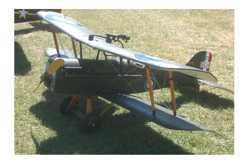
Best WWI-Sopwith Pup Tom Kosewski

Roy's plane was there one day and then it went back to Long Island. It was viewed by the judges, but no photos are available. It looks great.