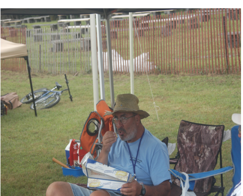
While observing his men, the flight line director manages to keep from starving.