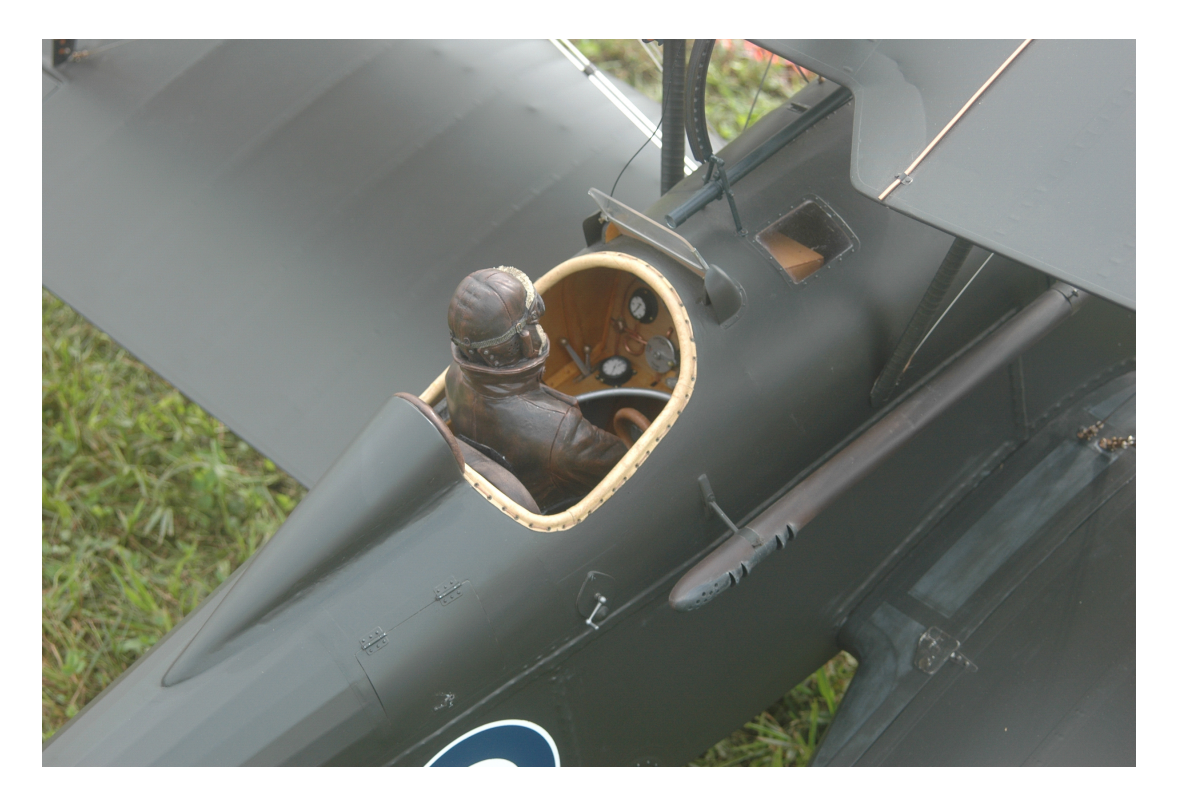
Some planes demand a closer look!