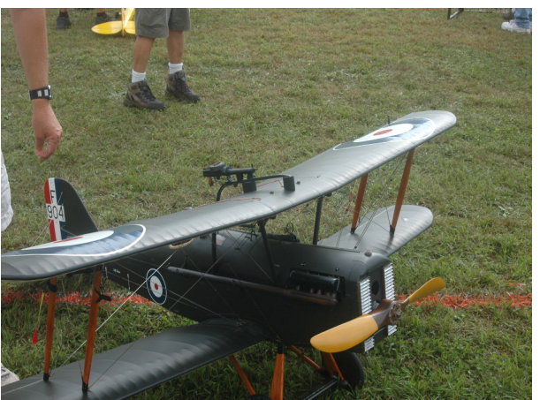
What a work of art!.