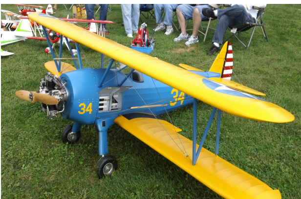
One of the beautiful PT 17's at the event!