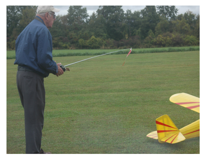
Jim Wood preparing to taxi out for one of his several very nice flights of the day.