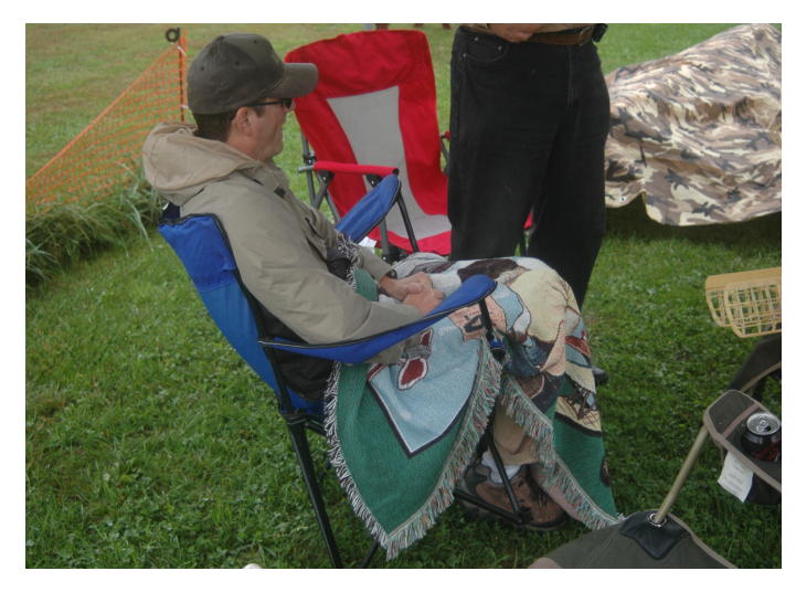
No wonder some people need to move south.....it is only Sept. Whit. And on the other hand so few days left to pick on you before you move on!

Good to the last minute-some members made sure to get some flying time during the last weekend of September!