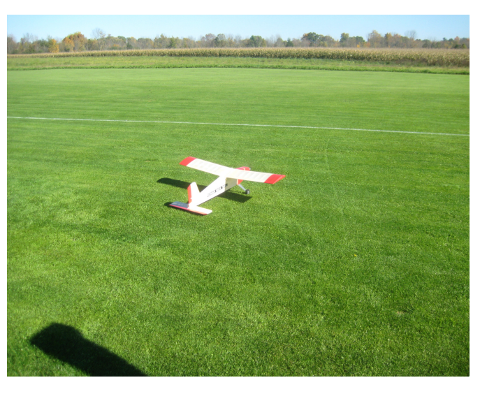
Otto's Scrap Box Special did some nice flying.