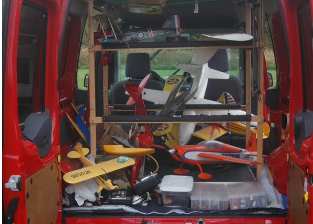
We did have to wait out a little rain.