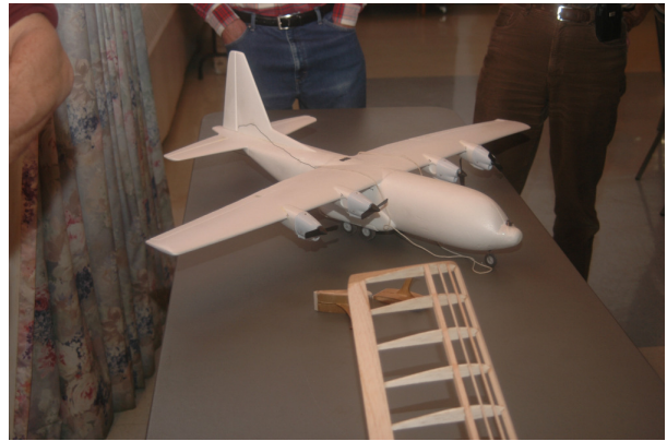
A few photos of Rick's most recent projects.