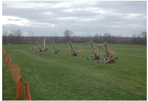
The 2011 flying season at the Wallkill field is underway!