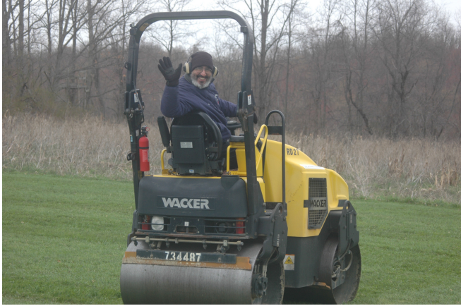
Let the good times roll, roll on and on!