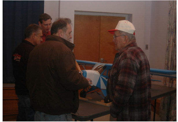
And the Cub has been back in the air since these photos.