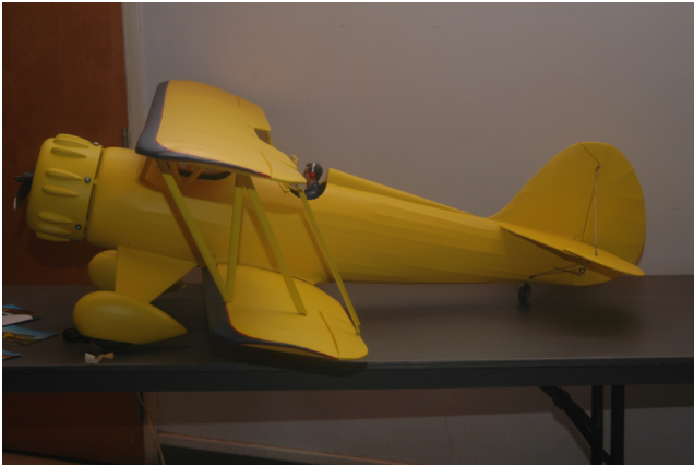
An up close look at Jim's Classic Waco! His basement now matches the plane in color due to a little over spray!