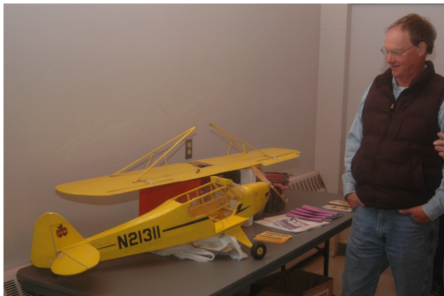
A very nice old Cub is going to get a chance to try its wings.