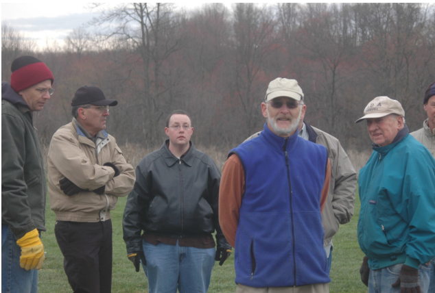
Club members? Or a typical town work crew! Sorry guys!

Time to go outside– The Walkill Field Work Party! And Baby it was cold outside!