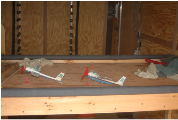
A sneak peek inside our president's utility trailer!