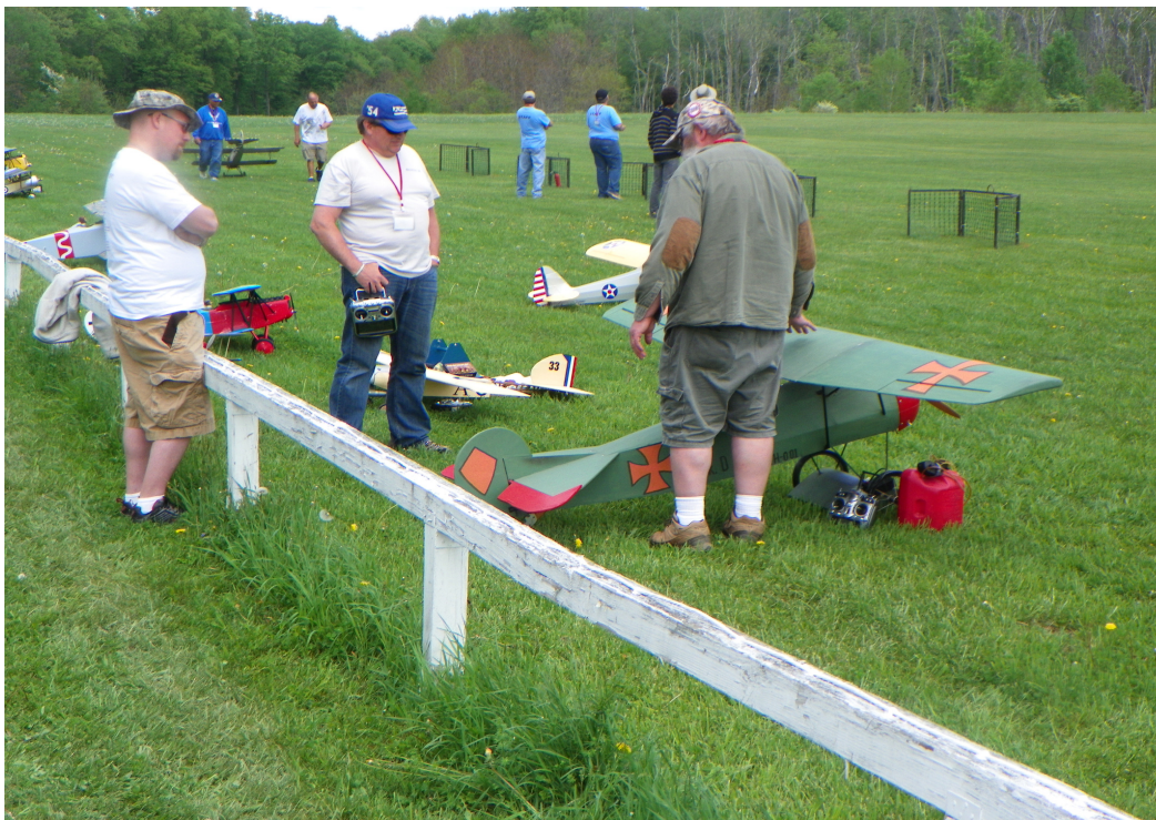
Ken Hall's 1/3 Razor has probably seen as much air time over Rhinebeck as any of the full scale aircraft.