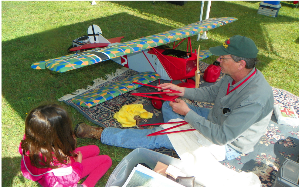
Our president assembles his D 7 under close supervision.