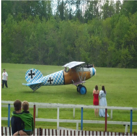
On the move for to the South end of the runway for take off.