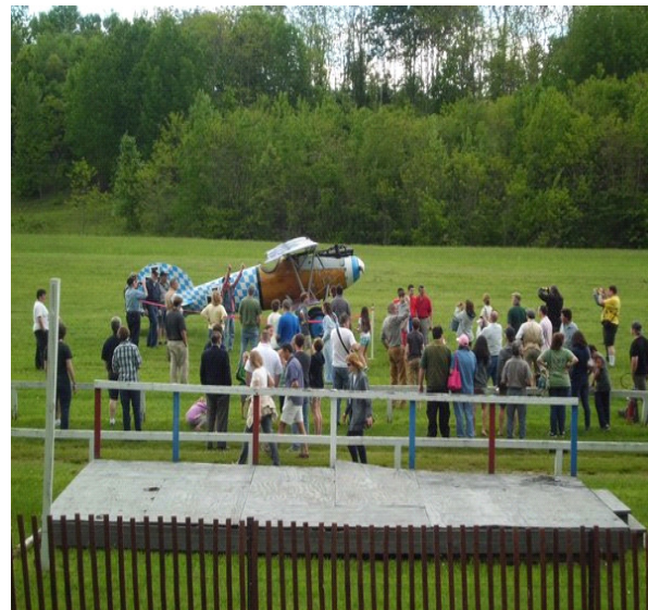
And there's the Albatross in her new colors