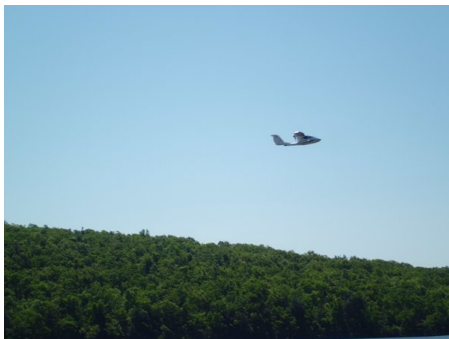
The same foam airplane in the air. It seemed to be a little touchy on the sticks but was lots of fun to watch.