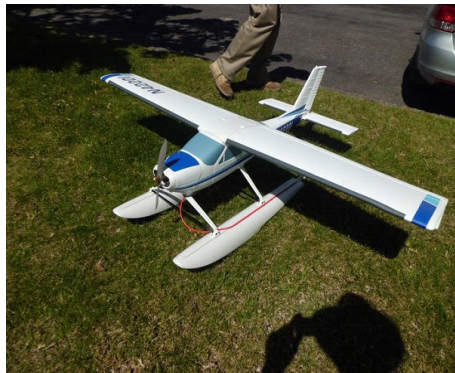
Otto's Lorents seaplane during a taxi test on the right. Engines were acting up so a flight was not planned. Great turnout and good weather. Warren