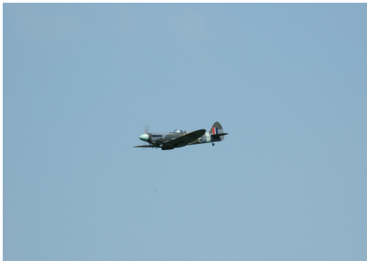
The Spitfire in the air.