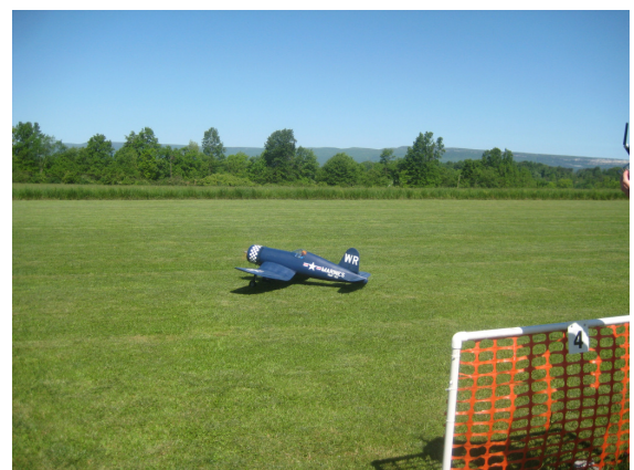
Whitney's Corsair rolls out for a flight.