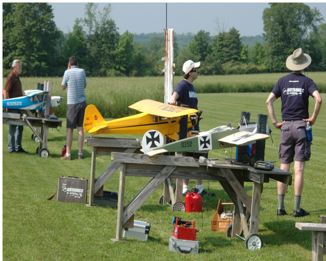
Some of the line-up at the Wallkill Field