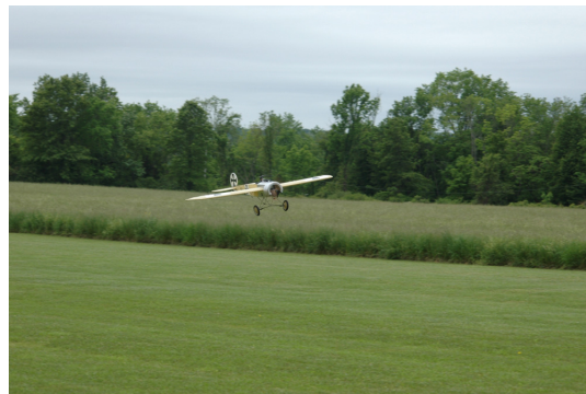
An equally beautiful soft touch down!