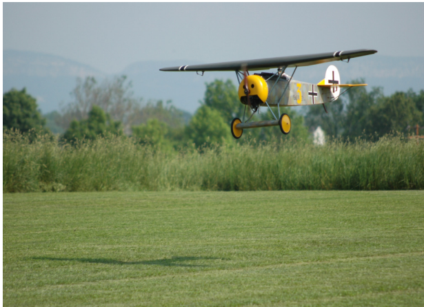
The D-8 Coming in for a beautiful landing.