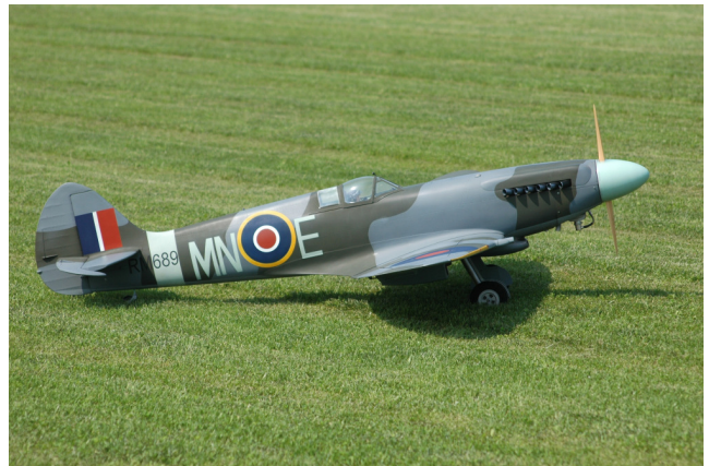
Whitney's fine looking Spitfire ready to launch!