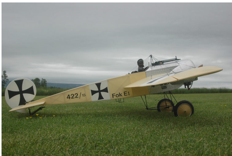
The successful maiden flight behind it, Jeff's Eindecker poses for a photo shoot. Congrats Jeff on a highly impressive build and flight!