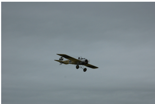
A beautiful maiden flight!