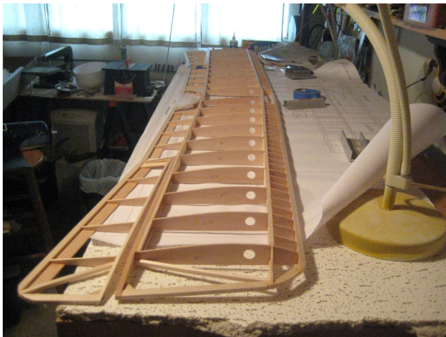
The upper wing framed up..

The old homemade fuselage jig was pulled out of mothballs after sitting around for many years! It still works great and if anyone would like to borrow it for a project, just ask.