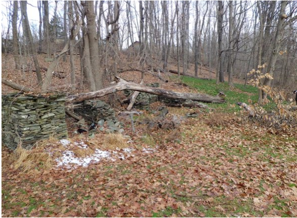
A before photo of the area behind Cole's house. Years of damaged trees and debris.