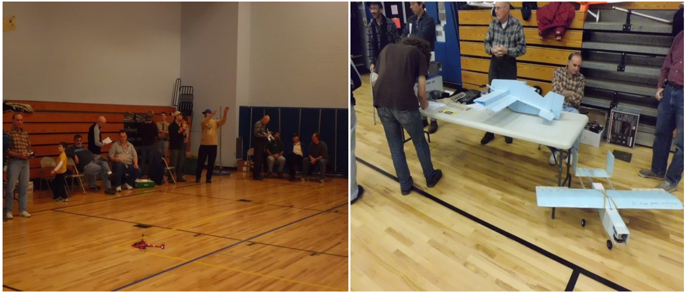
Pictures of the Model Masters Dec. Indoor Flying session at the Highland Middle School. Lots of familiar faces.

The MHRCS work parties helping at the Rhinebeck Aerodrome continue.