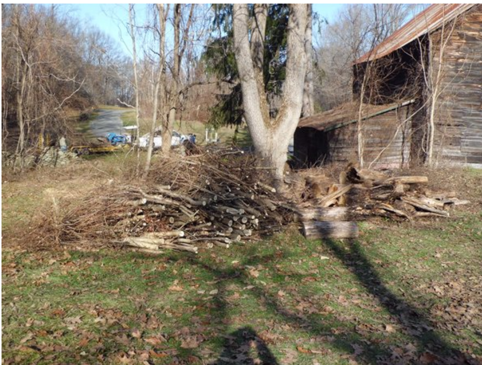
Warren reports "Just one of the 2 big piles we had at the end of the day. Sorry Mike!!!"