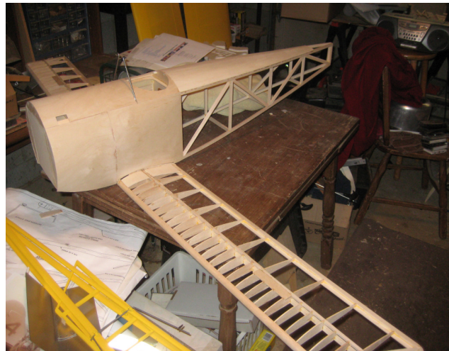
The bottom wing ready to get wing mount dowels.

That is it for now. Wishing you all a very happy and healthy new year! CAVU - Ron Revelle