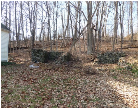
After shot. Cole's house is on the left. The one leaning tree in the middle needs to come down but is hung up in the other trees. Little to unsafe for us that day.