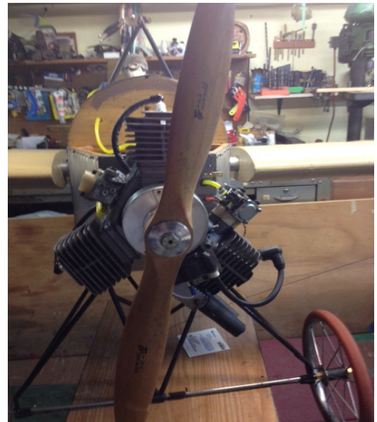
The mystery engine....Anybody know what it is? It will be at Rhinebeck 2012