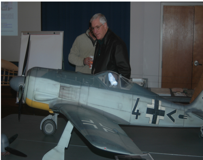
One last admiring look at one magnificent model aircraft.