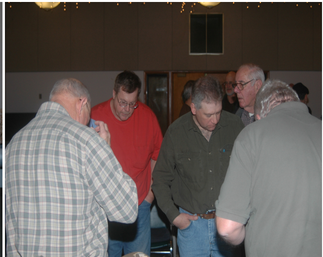
Lots of interested in the displays.