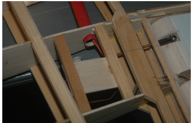
An inside view of Roy's next project.