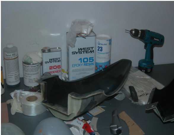
If you didn't write down the names of some of the supplies needed for the molding, this may help.