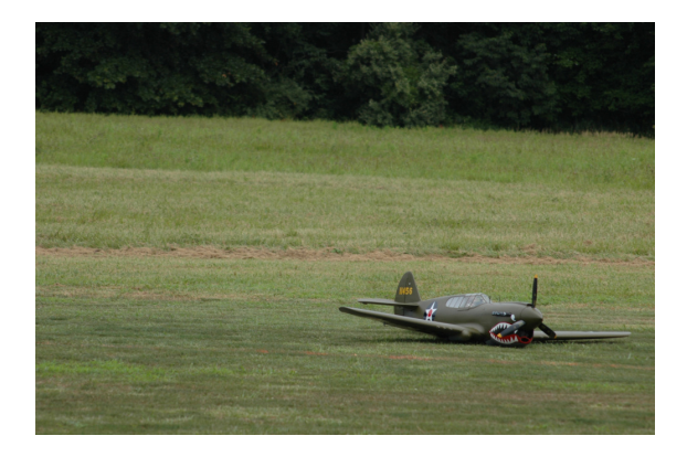
One of many gear up landings!