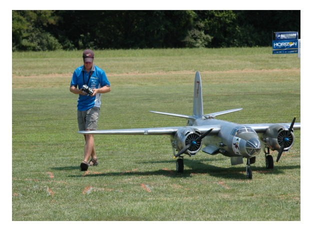
Paul's beautiful B-26