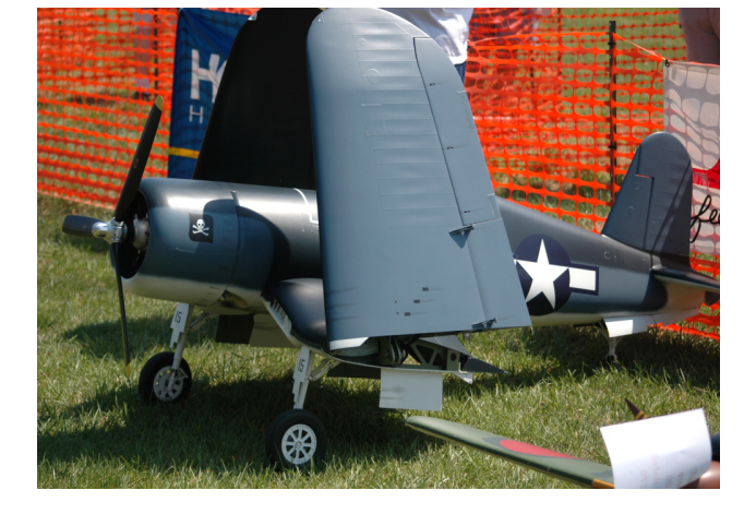
One gorgeous Corsair. Wings fold up remotely on the field.