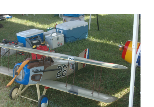
A BUSA USA Spad that flew a number of missions.