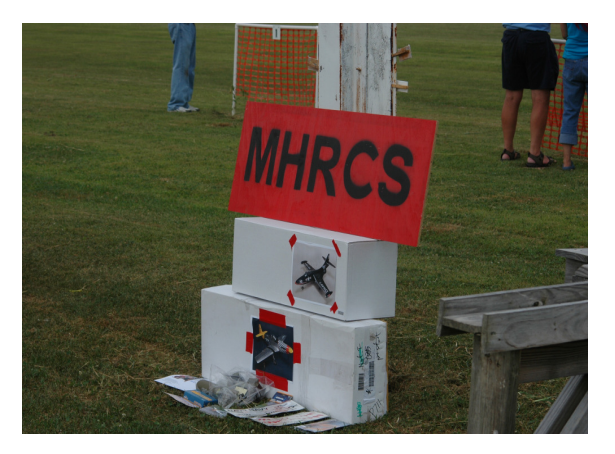
Some of the fine prizes that were donated.