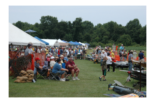
A view of some participants. Observers were behind a fence.