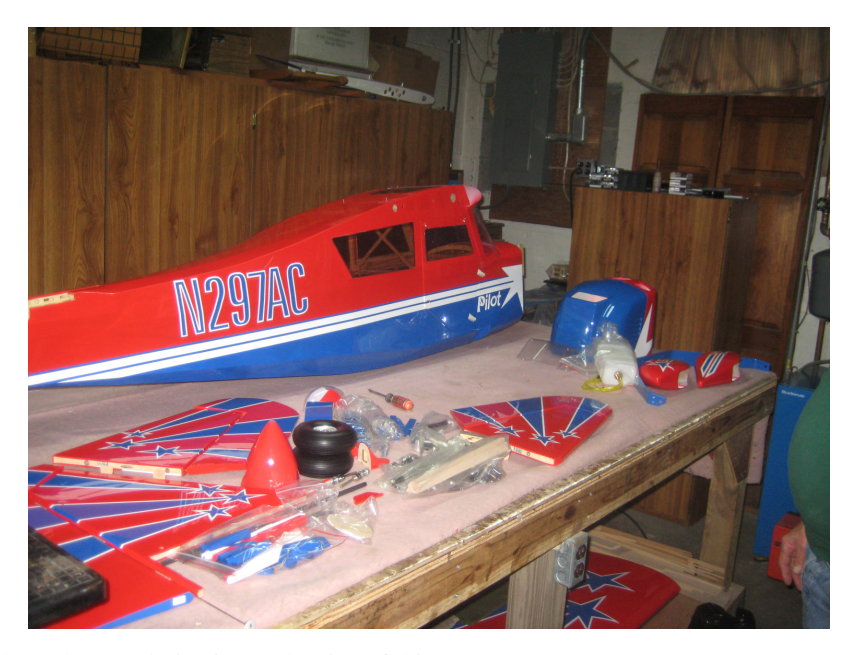
The photo doesn't do justice to the size of this monster...