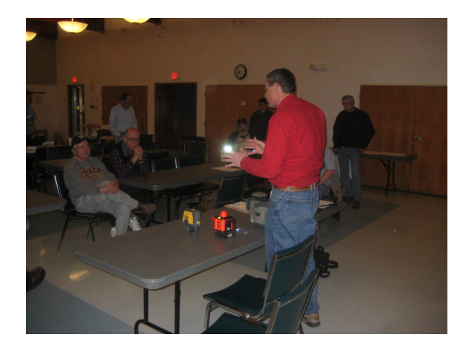
Pres. Warren demonstrated the use of several lasers which could be very useful in the construction of models, not to mention the many other uses around the house. A couple of the lasers Warren spoke about were relatively inexpensive. Lasers have always made the editor a bit uncomfortable since seeing where they were headed in Gold Finger.