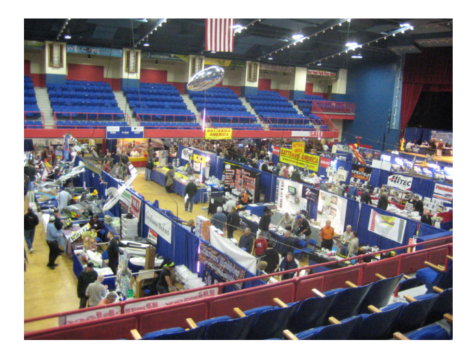
The Show seen from above!