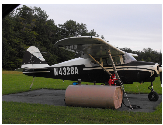
A closer look at the Piper owned by the property owner.