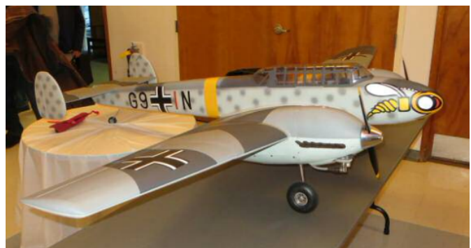
Charlie Knight's ESM 110