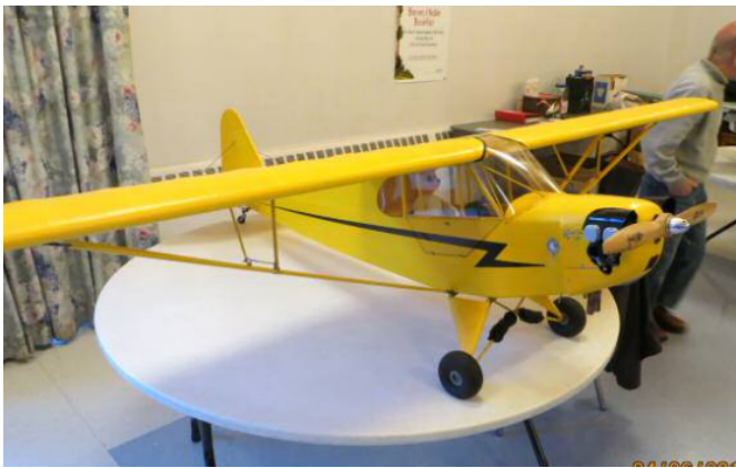
Flavio Ambrosini's Cub