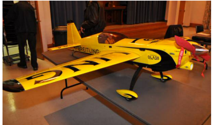
Charlie Knight's Breitling powered by a DLA-58