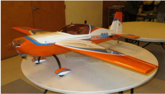
Ron Revelle's Extra