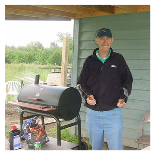
More photos on Page 4

Except for the wind it was a very nice day.